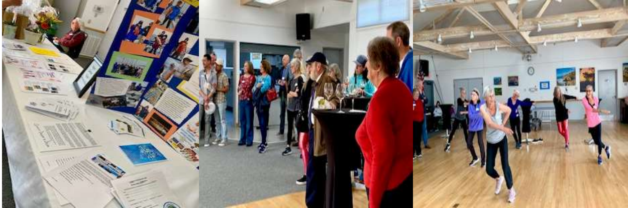
Above: Scenes from the Chamber Mixer